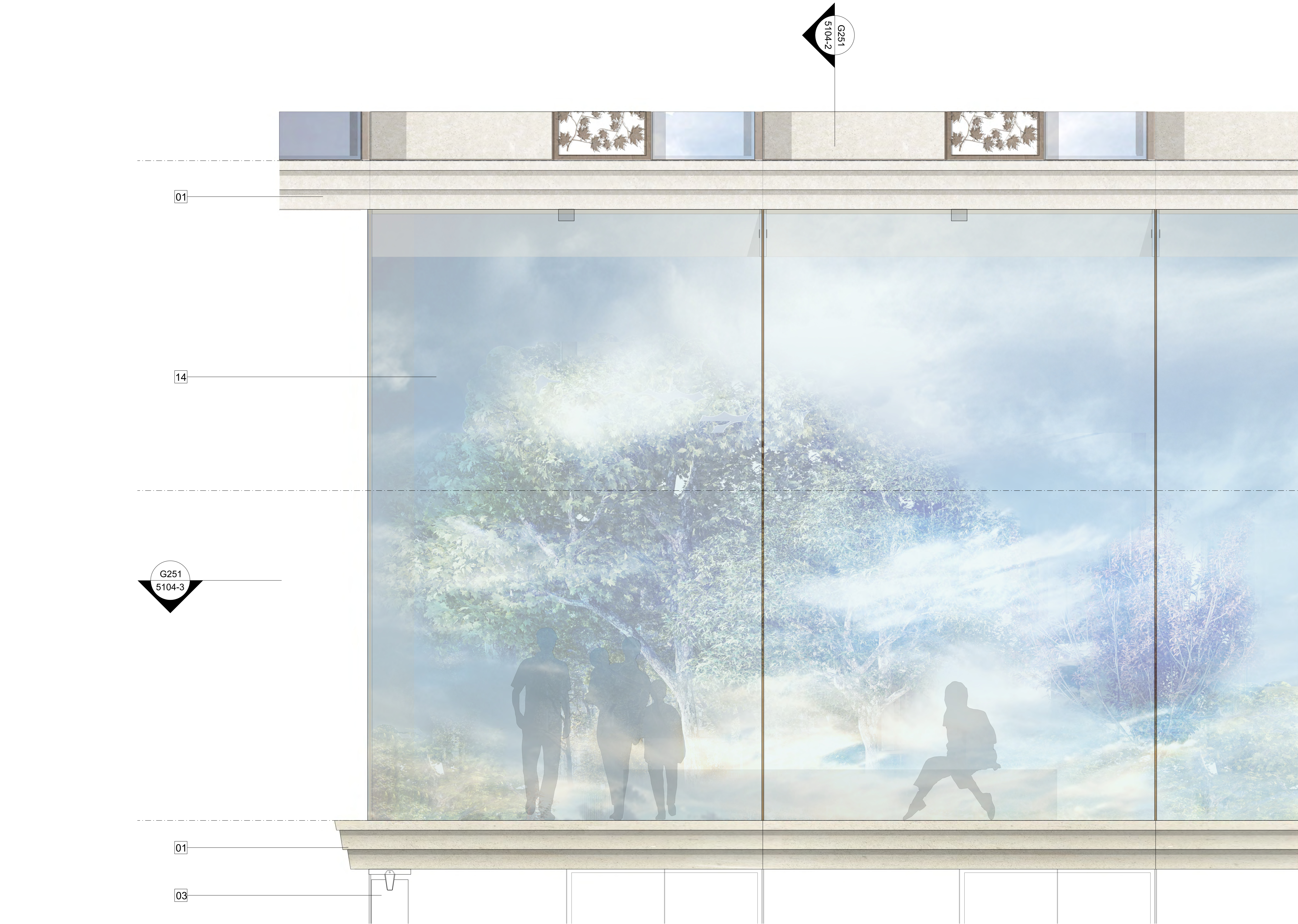
G251 5104-1 Detail Elevation